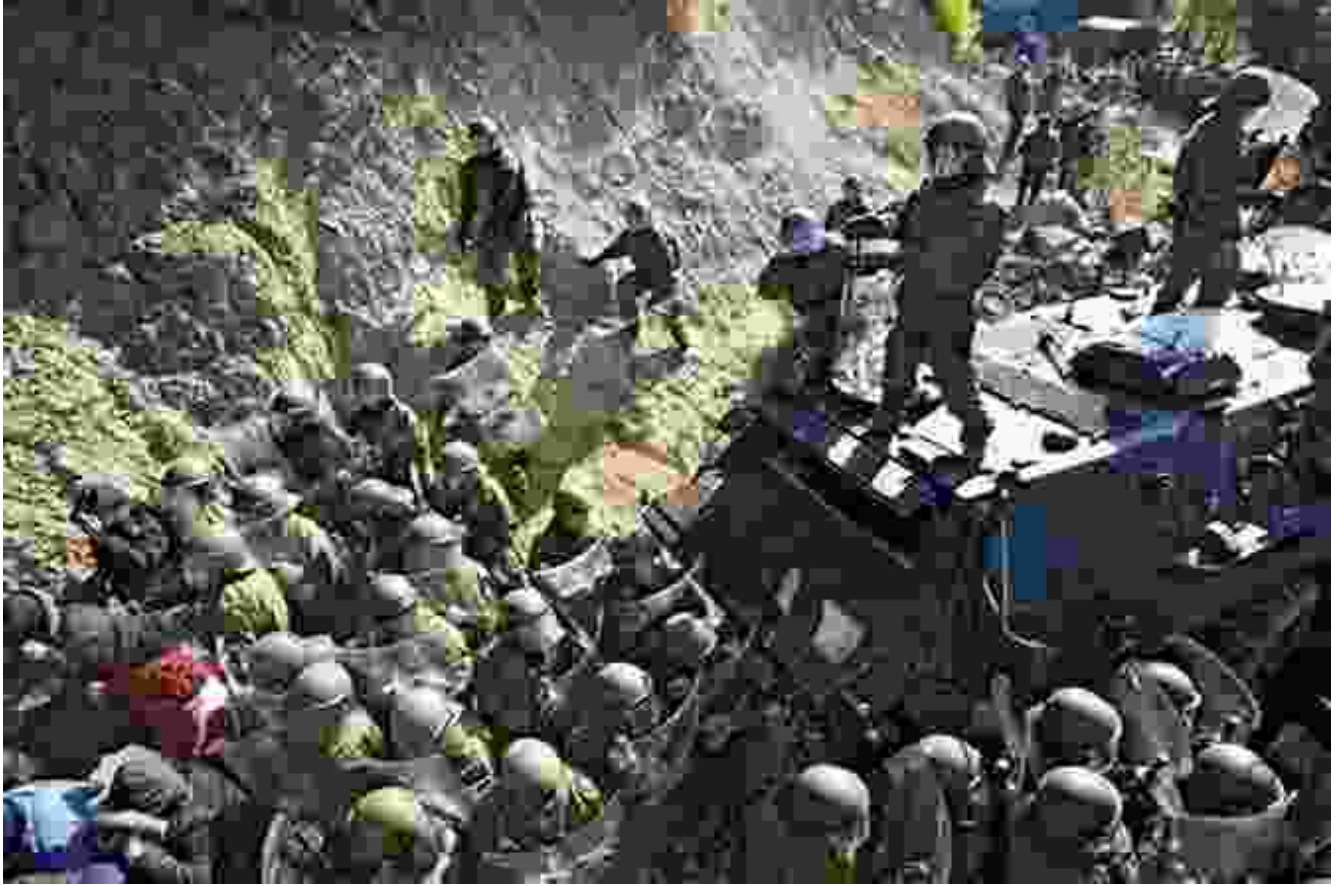
The Kosovo Conflict: A Complex Struggle for Independence and Sovereignty