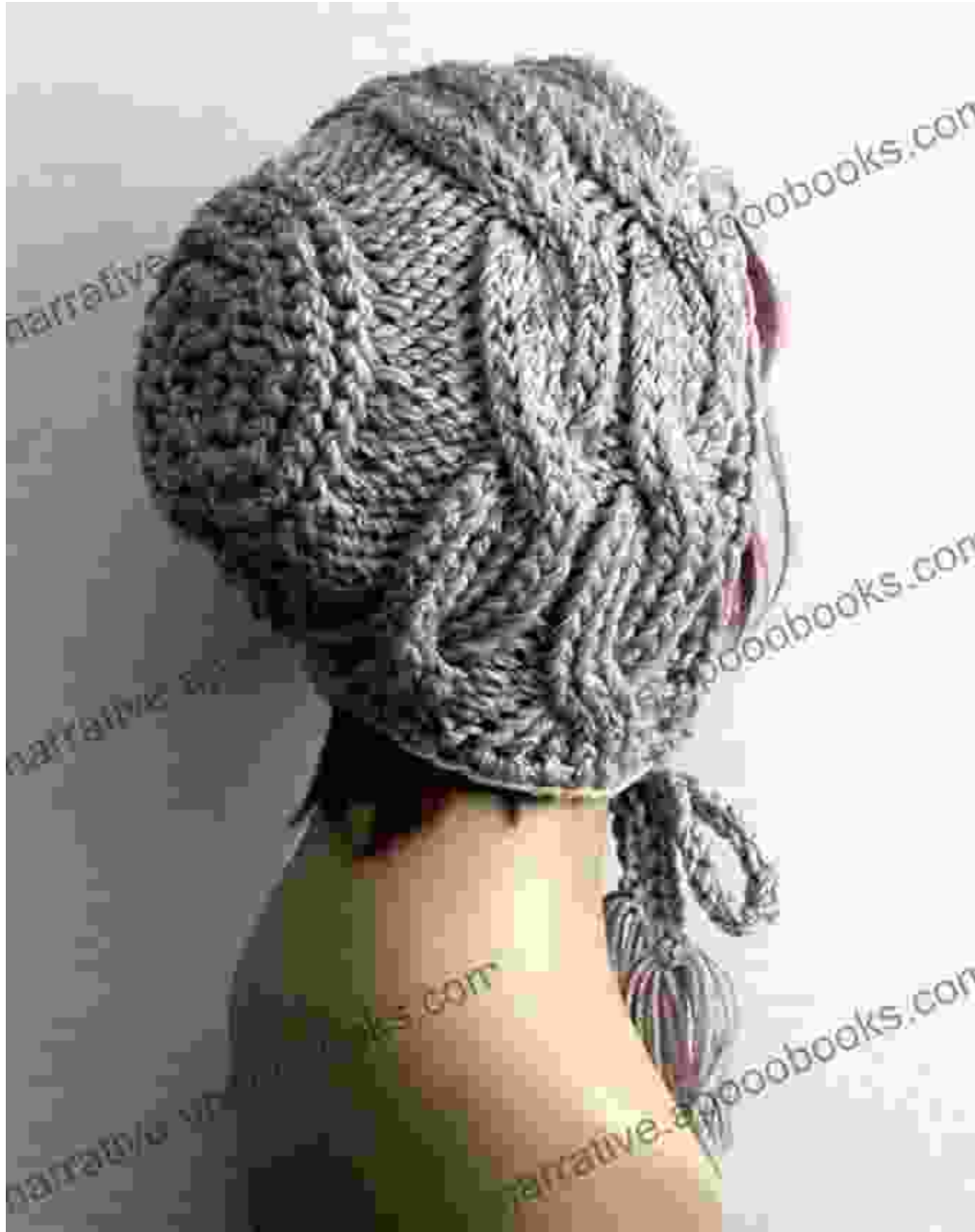
Cable Stitch Earflap Hat