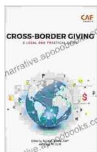
Image Alt Attribute: Book cover of "Cross Border Giving Legal and Practical Guide" featuring a globe and handshake symbolizing international collaboration in philanthropy.

Don't miss out on this opportunity to unlock the transformative power of cross-border giving. Free Download your copy of the Cross Border Giving Legal and Practical Guide today and empower yourself to make a meaningful difference in the world.