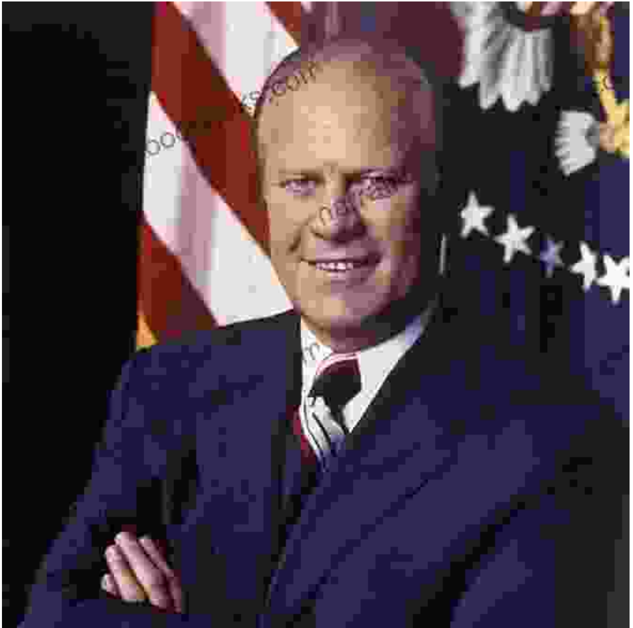
Gerald Ford, 38th President of the United States