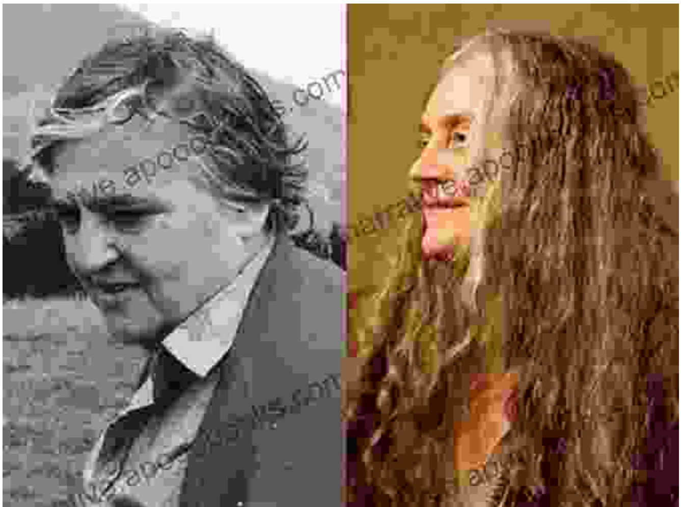
Etel Adnan, reading from her poetry, 2018.

Adnan began painting in the 1950s, experimenting with vibrant colors and abstract forms. Her early works were influenced by abstract expressionism, particularly the work of Mark Rothko and Jackson Pollock. However, Adnan developed a unique style that set her apart from her contemporaries. Her paintings often feature layered washes of color, creating a sense of depth and movement. The interplay of light and shadow in her work evokes an ethereal and contemplative atmosphere.